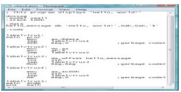
Figure 1: Assembly code of Virus File

The mutating behaviour of metamorphic viruses is due to their adoption of code obfuscation techniques like dead code insertion, Variable Renaming, Break and join transformation. Figure 1 shows the assembly file of the virus code. Computer viruses like polymorphic viruses and metamorphic viruses use more efficient techniques for their evolution so it is required to use strong models for understanding their evolution and then apply detection followed by the process of removal. Code Emulation is one of the strongest ways to analyze computer viruses but the anti-emulation activities made by virus designers are also active [4] [5] [6][7] [8].